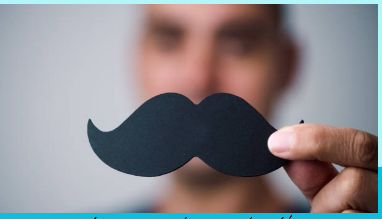
hearing care with a personal touch!

Movember's organization funds programs all over the world for prostate cancer, testicular cancer, men's health, and mental health & suicide prevention.